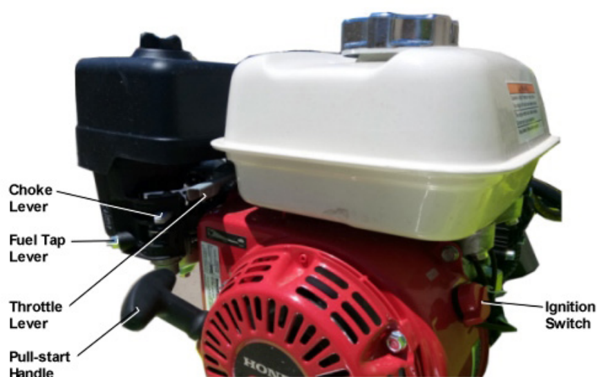
Figure 3 – Engine Start-up

If the FireAttack is not going to be used within the next few hours, shut the system down by turning the fuel tap to OFF.