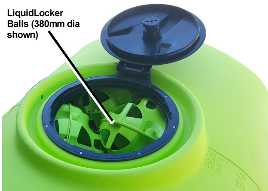
Figure 1 – LiquidLocker Ball Baffle System

The LiquidLocker system, as installed in a TTI tank, is shown in Figure 1.