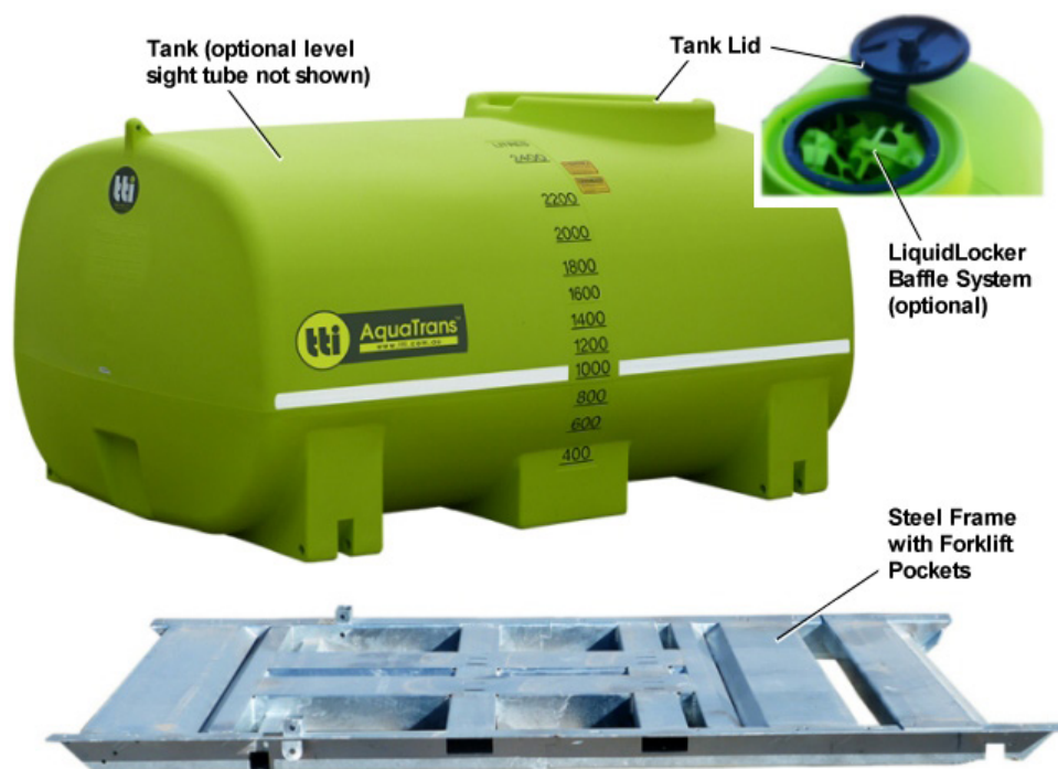
Figure 1 – Component Identification

The TTI AquaTrans & AquaMove is designed to carry water and benign fluids safely and effectively. The AquaTrans & AquaMove has the following features, refer to Figure 1.